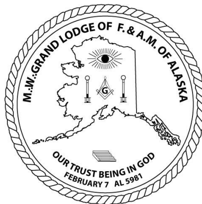
Grand Seal of The Most Worshipful Grand Lodge of Free and Accepted Masons of Alaska

I hope you have enjoyed this beautiful golden nugget of our Alaska Masonic History